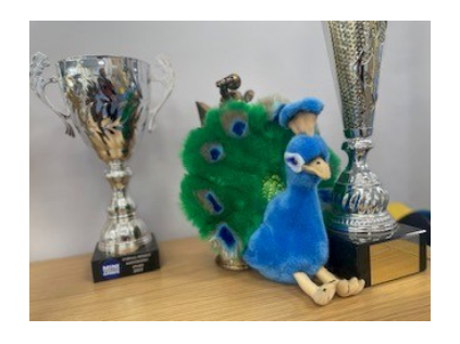
Punctuality Peacock 2F & 5M

Highest attendance and lowest number of lates for the whole academic year