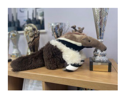
Attendance Anteater 2F & 5M